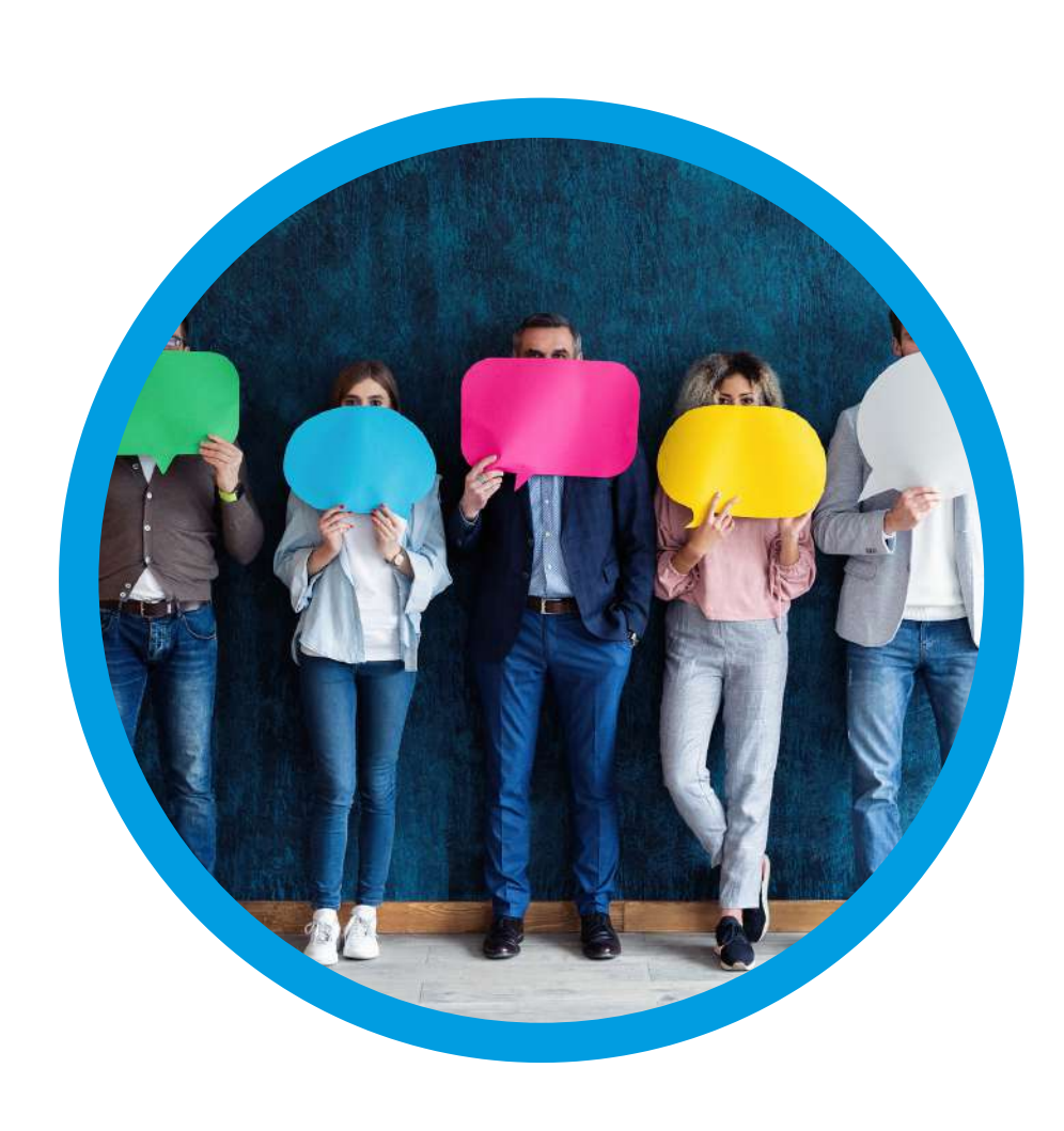
Learning a new language from A0 level