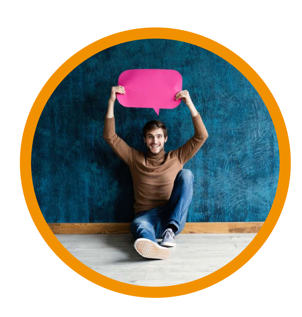
Improving foreign language skills with native speakers