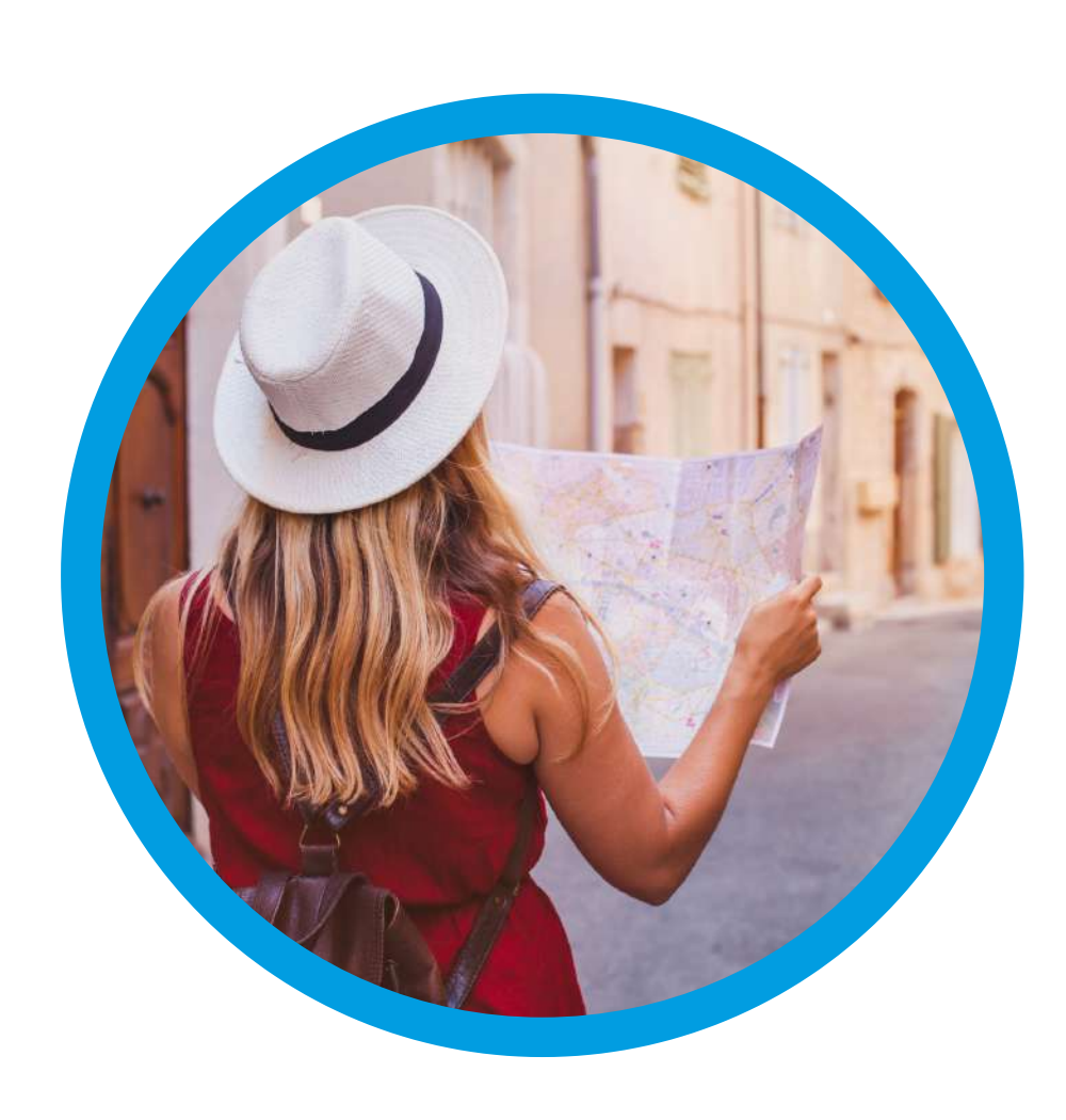
Understanding and learning about different cultures