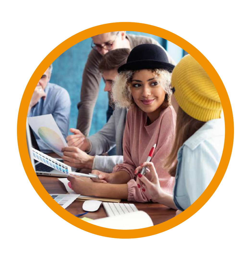
Developing intercultural competence through international collaboration